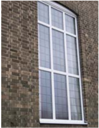
Large casement window with square lead