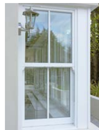
Sliding sash with single external fret