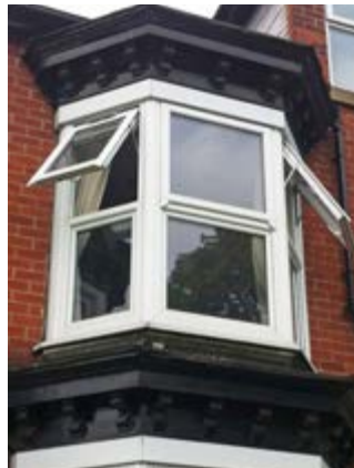
Mock sash bay window with top openers and tilt and turns below