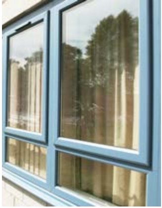
Blue casement top openers