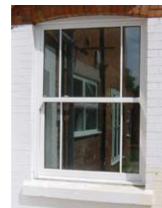
Sliding sash with double external fret