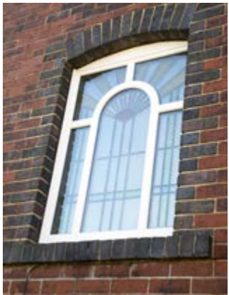
Bespoke casement window with original stained glass triple glazed