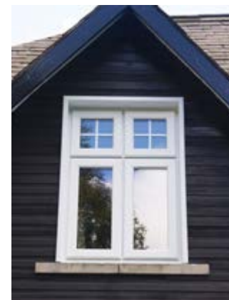
Casement window with dummy sashes and internal fret in top lights