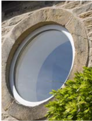
Circular casement window