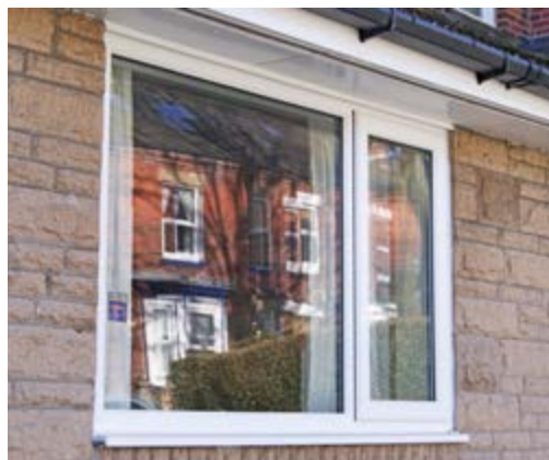
Casement window with side opener