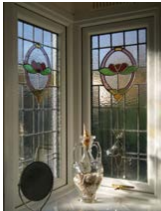
Oriel window with original stained glass triple glazed