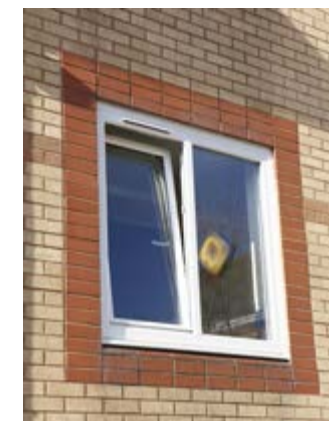
Tilt and turn window