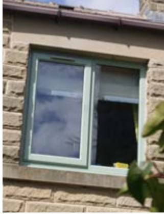
Green casement with side opener