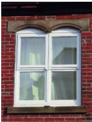
Mock sash window with top openers and tilt and turns below

Here are just a few examples of windows we have manufactured in the past to give you some ideas and inspiration for your own home.