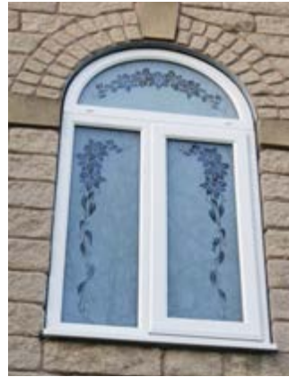
Arched casement window with etched glass and side opener