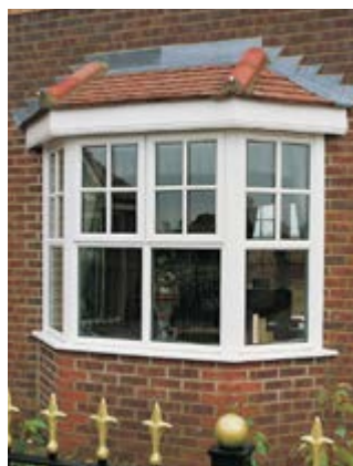
Bay with external fret in top lights