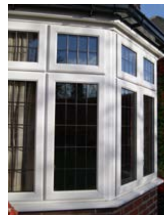
Bay with square lead and dummy sashes