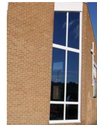
Large panoramic casement window with raked head