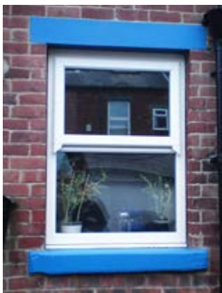
Mock sash with top opener and fixed light below