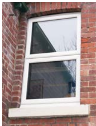
Casement top over top opener