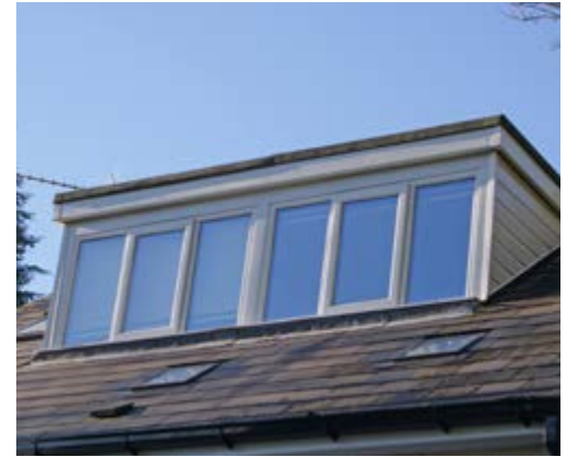
Dormer casement window with top openers