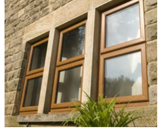
Golden oak top openers over top openers