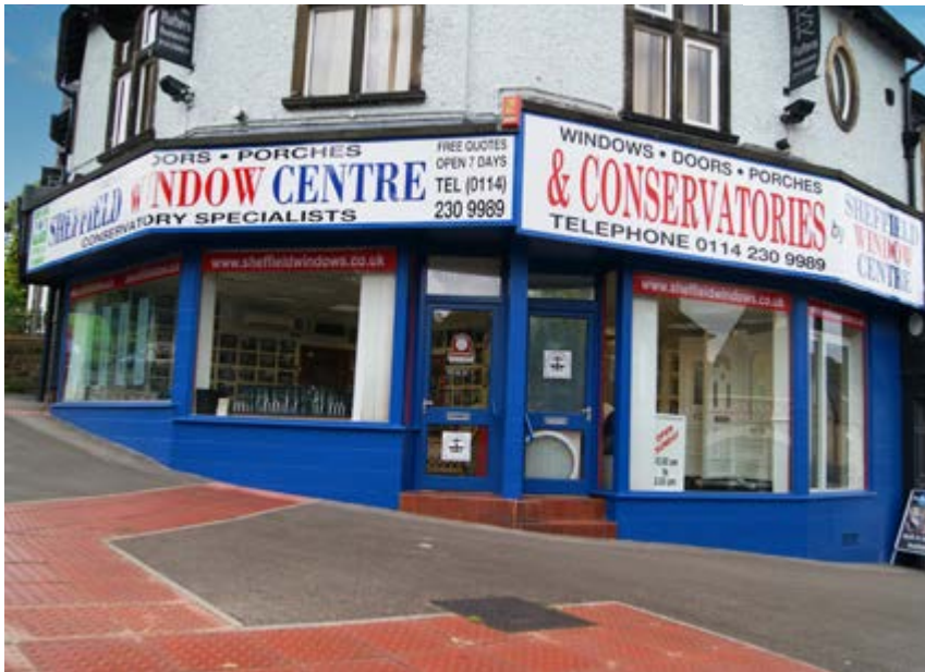
Nether Green Showroom, Oakbrook Road

Sheffield Window Centre is a local family business , established in 1975 with more than 45 years of continuous trading. We manufacture high quality uPVC windows, doors and conservatories in the heart of Sheffield. Over the years, we have worked hard to build a reputation as the double glazing company that you can trust, offering beautifully crafted, custom made products, honest advice and first class customer service.