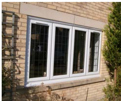
Casement window with lead, dummy sashes and side openers