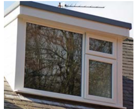
Dormer casement window with top opener and side opener below