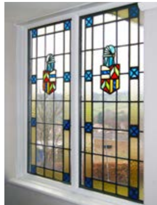
Window with original stained glass triple glazed