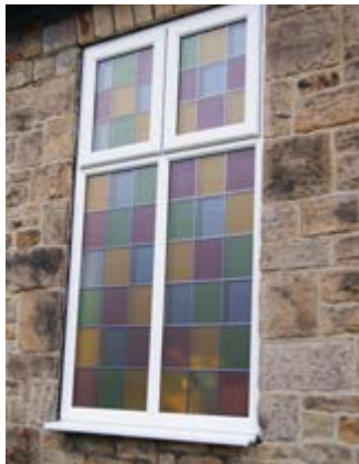
Casement window with lead and coloured film