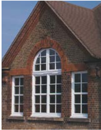
Georgian style arched window and sides