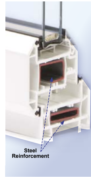
Diagram 1: Steel reinforcement

We are FENSA registered, and are members of every reputable trade association, including the Glass & Glazing Federation, Conservatory Association, The Glazing Ombudsman and more.