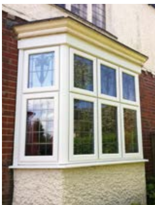
Bay window with lead and triple glazed original top lights