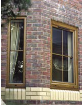
Golden oak tilt and turn with internal fret