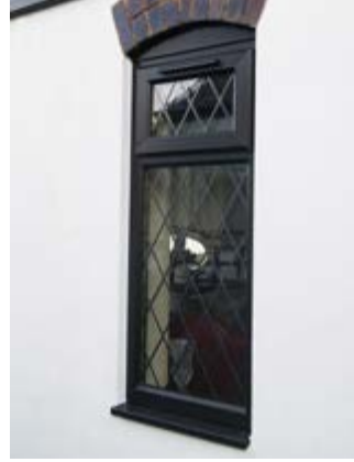
Black casement window with diamond lead