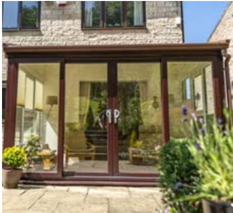
2 pane woodgrain inline sliding patio door with silver handle