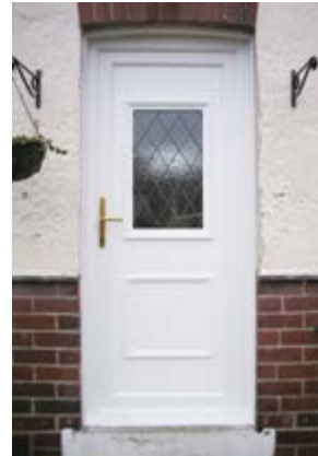
uPVC back door panel with diamond leaded glass