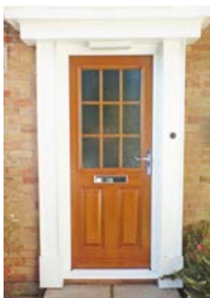
Golden Oak Elegance style composite with Georgian bar