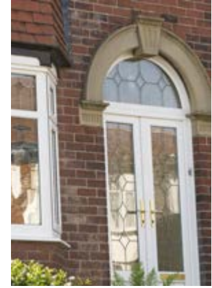
White French front doors with arched toplight and lead design