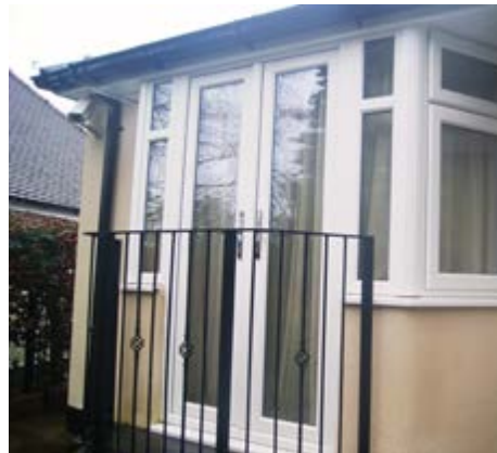
White French doors with chrome handles in centre of bay