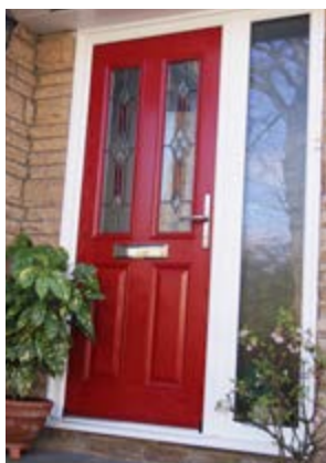
Red Esteem style composite with Roman bevel design and fully glazed sidelight