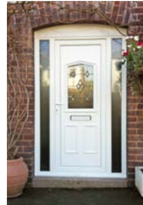
uPVC with Jacobean 1 Bevel A panel and fully glazed sidelights