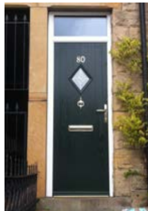
Black Renown Diamond composite with diamond Andaman brass glass