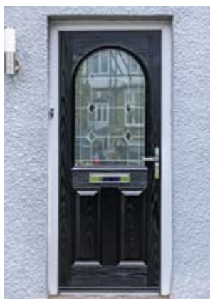
Black Elegance Arch style composite with Palma glass