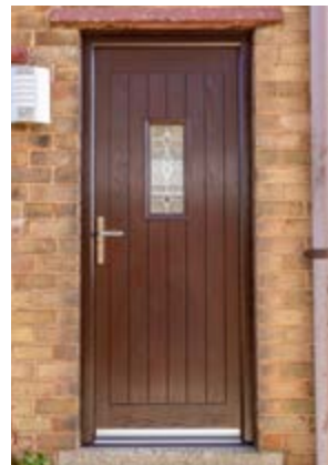
Rosewood Rustic Renown style composite with Kara glass design