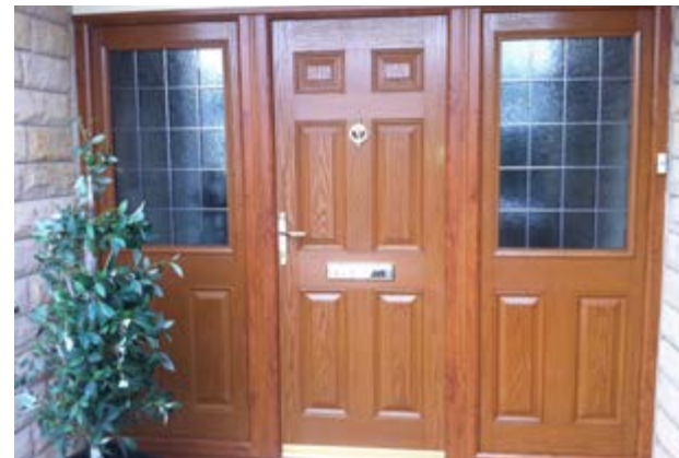
Golden oak 6 panel solid composite with composite side lights and square lead in top section