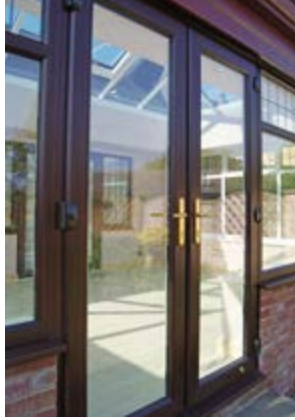
Rosewood French doors with gold handles in conservatory