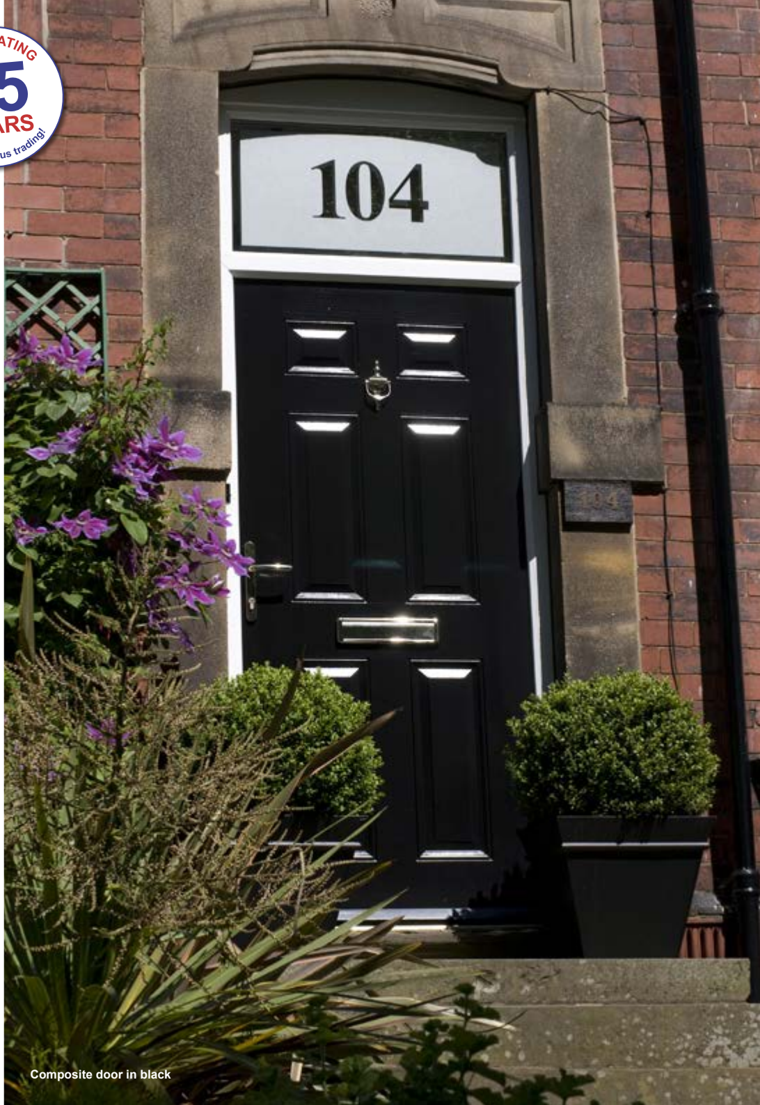
Composite door in black