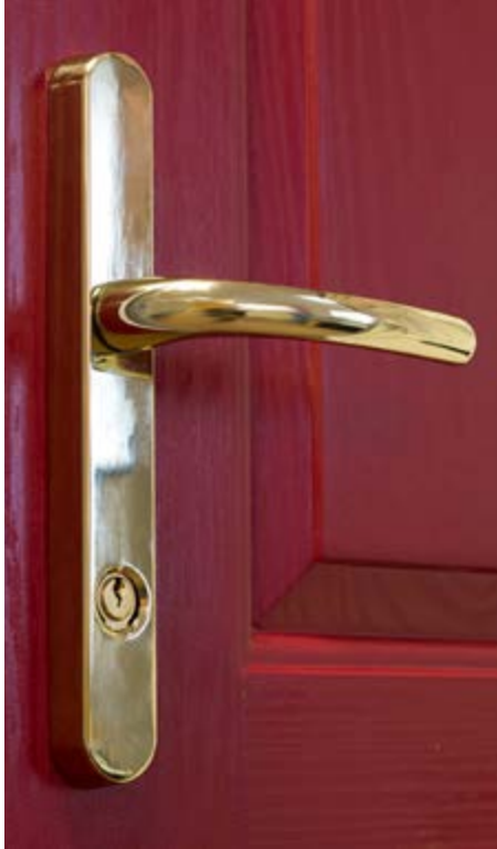
High security handle