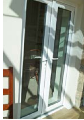
White French doors with white handles