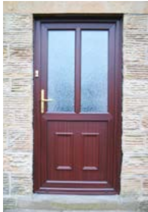
uPVC Mahogany with midrail, vertical mullion and Edwardian half panel