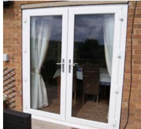
White French doors with silver handles