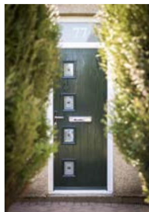
Green Esprit C09 style composite with etched glass