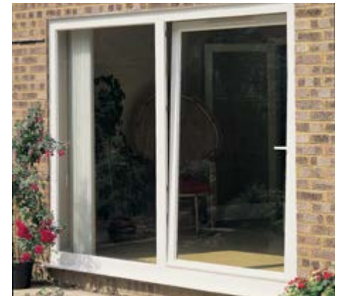
2 pane white tilt and slide patio with white external handle