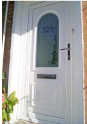
uPVC with Devon panel and etched glass design