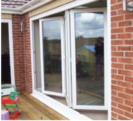
4 pane white bi-folding doors