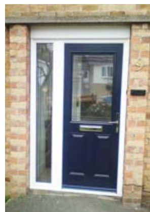
Blue Elegance style composite with sidelight and border lead