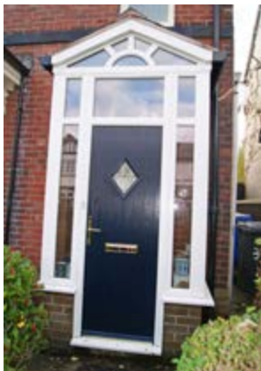
Blue Renown Diamond composite with Andaman brass and sidelights