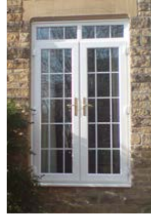
White French doors with gold handles and Georgian fret