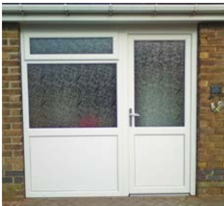
uPVC door and sidelight with midrail and plain panel to lower section