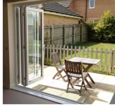
3 pane white bi-folding doors