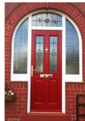
Red Esteem style composite in arched frame with lead and bespoke bevel glass design