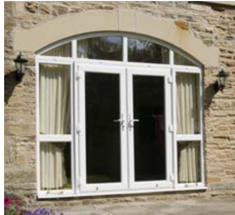
French doors with white handles, arched toplight and sidelights with midrails