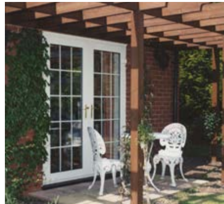
White French doors with gold handles and Georgian fret