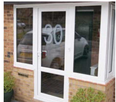
uPVC door with midrail, glazed top and bottom with an etched number in top section