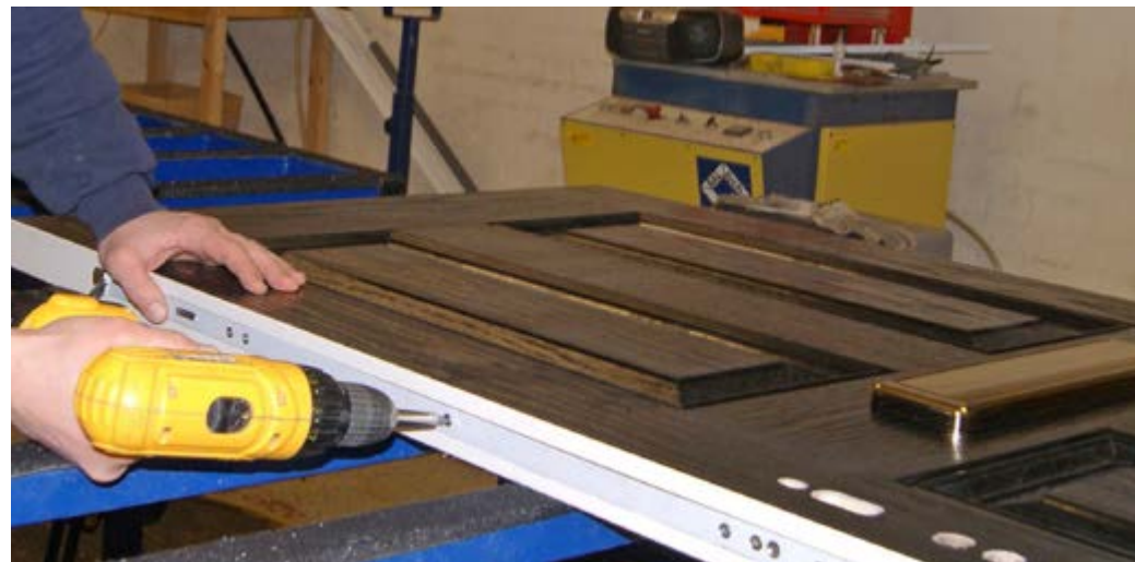
Door security features being installed in our factory

For maximum protection against intruders, every door installed by Sheffield Window Centre is fitted with a high security handle. These handles have patented features that make forced entry almost impossible, and when fitted in conjunction with our security cylinders, we can say with confidence that our doors give you total peace of mind.