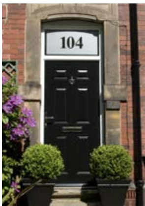
Black solid 6 panel composite with etched glass toplight