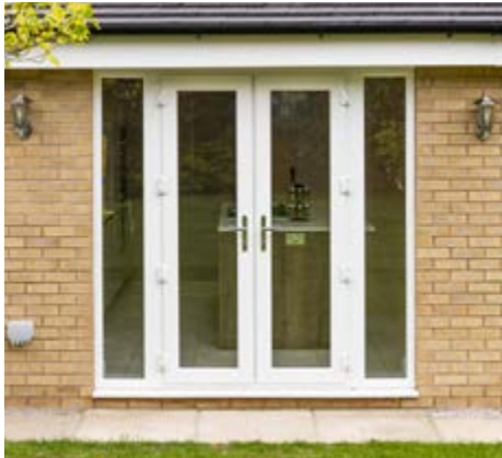
White French doors with chrome handles and full height sidelights