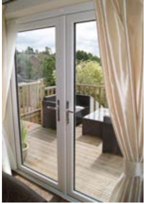
White French doors with chrome handles