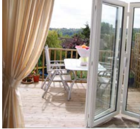
4 pane white bi-folding doors