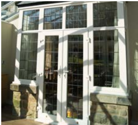
White French doors with white handles, sidelights, toplights and square lead