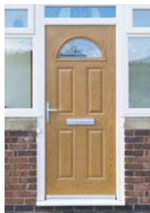
Oak Eclat Arch style composite with sidelights and number etched glass design