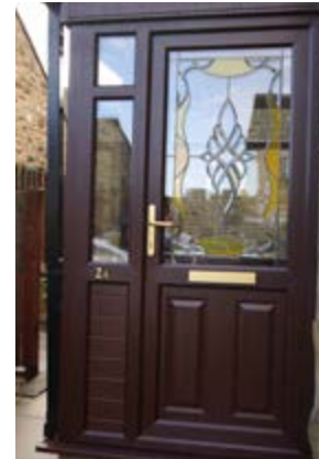
uPVC Rosewood with decorative glass, sidelight, midrail and transom