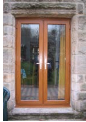
Golden Oak French doors with chrome handles