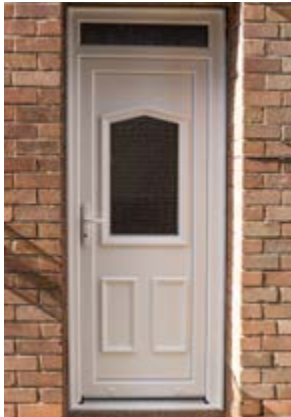
uPVC with Victorian panel