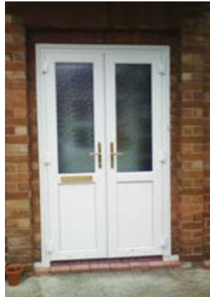
uPVC French doors with midrail and plain panels to lower section

All of our doors are made-to-measure and with so many designs, colours and finishes to choose from, the possibilities are endless! The following pages show a selection of doors we have manufactured in the past to give you some ideas and inspiration.