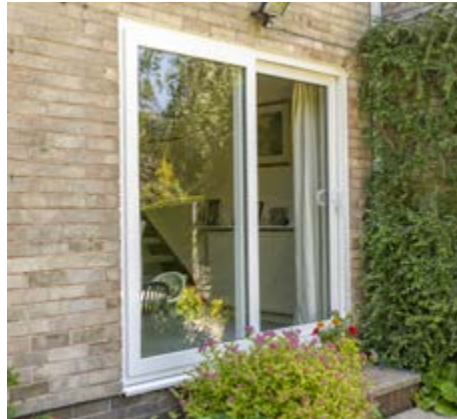
2 pane white inline sliding patio door with white handle