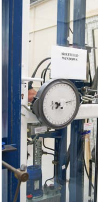
The weight of a Mini being applied to one of our uPVC doors