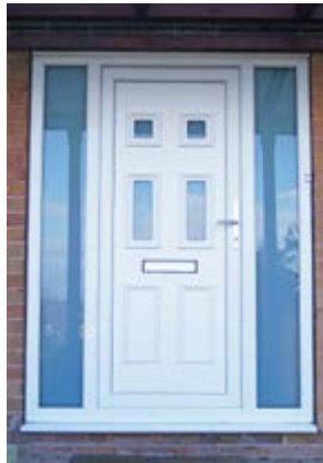
uPVC Edwardian 4 panel with fully glazed sidelights