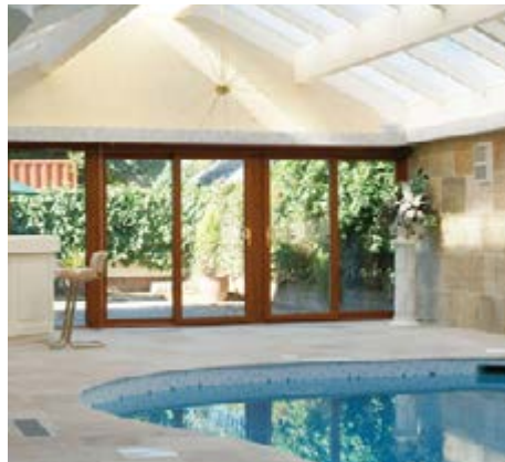
4 pane golden oak inline sliding patio with two gold handles