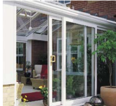
2 pane white inline sliding patio door with gold handle in conservatory