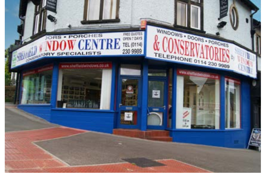
Nether Green Showroom, Oakbrook Road

First impressions count - and when it comes to your home this has never been truer than in the case of a front door. Whether you want to improve your home security, replace a draughty or outdated timber door or simply achieve that much sought after 'kerb appeal', Sheffield Window Centre can offer you the perfect solution for your home.