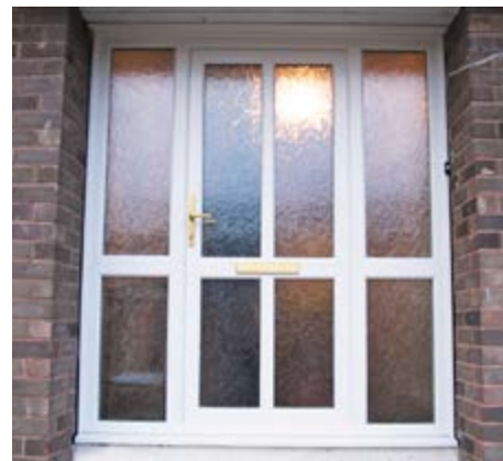
uPVC door with midrail and top to bottom vertical mullion with sidelights, also with midrails