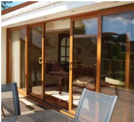
4 pane golden oak inline sliding patio with two gold handles