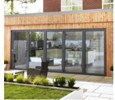
5 pane grey bi-folding doors