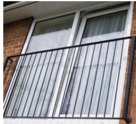
First floor, 2 pane white tilt and slide patio as part of Juliette balcony