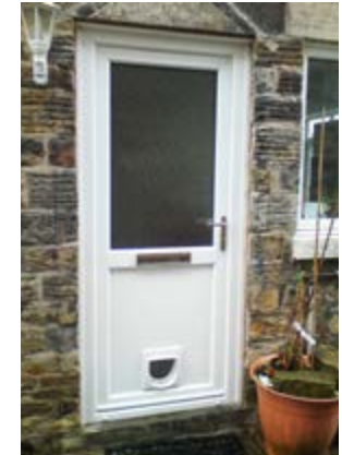
uPVC with midrail and plain panel to lower section with cat flap