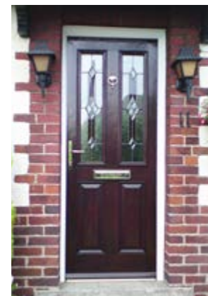
Rosewood Esteem style composite with Roman bevel glass design