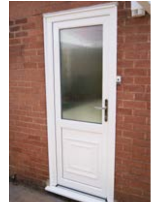
uPVC with midrail and Victorian half panel to lower section