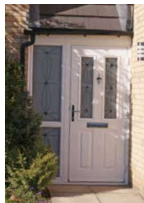
White Esteem style composite with sidelight and bespoke etched and bevelled glass design