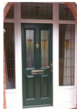
Green Esteem style composite in arched frame with bespoke coloured lead stained glass design