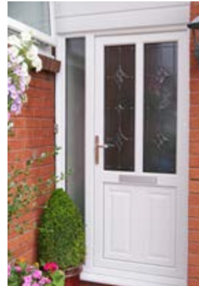
uPVC with midrail, vertical mullion and inverted Edwardian half panel