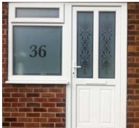
uPVC door and window with etched glass, midrail and vertical mullion