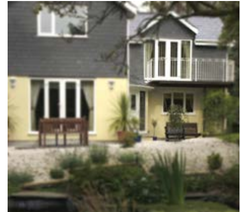
First floor, white French doors with sidelights