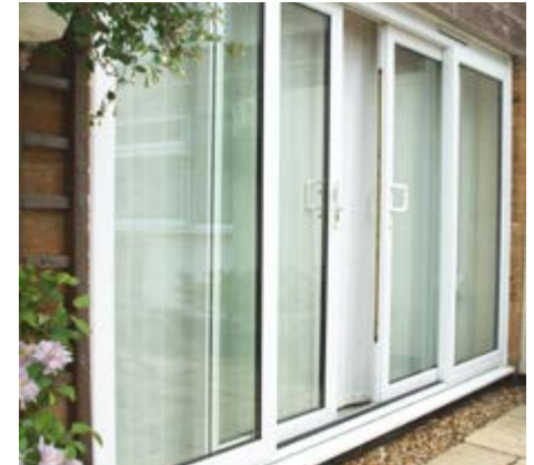
4 pane white inline sliding patio with two white handles