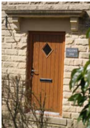
Golden oak Renown Diamond style composite with diamond glass