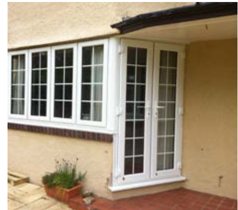
White French doors with white handles and Georgian fret