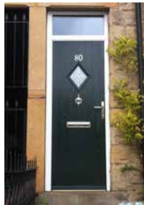
Black Renown Diamond composite with diamond Andaman brass glass