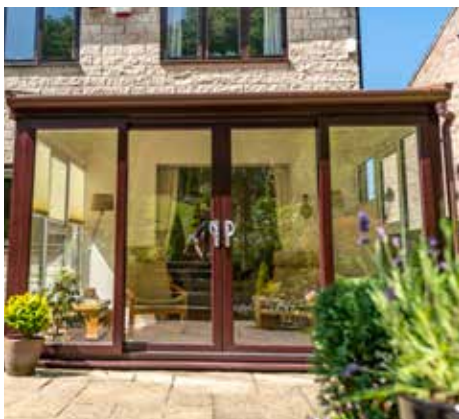
2 pane woodgrain inline sliding patio door with silver handle