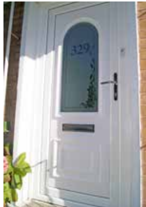
uPVC with Devon panel and etched glass design