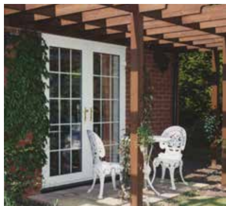
White French doors with gold handles and Georgian fret