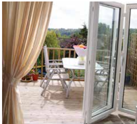
4 pane white bi-folding doors