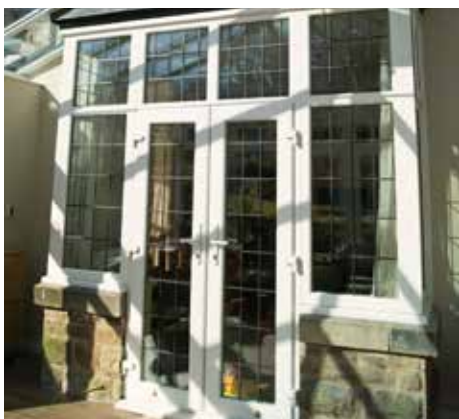
White French doors with white handles, sidelights, toplights and square lead