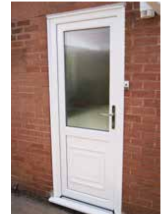
uPVC with midrail and Victorian half panel to lower section