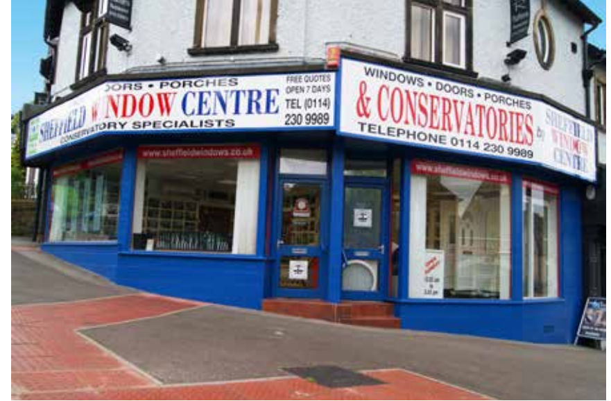
Nether Green Showroom, Oakbrook Road

First impressions count - and when it comes to your home this has never been truer than in the case of a front door. Whether you want to improve your home security, replace a draughty or outdated timber door or simply achieve that much sought after 'kerb appeal', Sheffield Window Centre can offer you the perfect solution for your home.