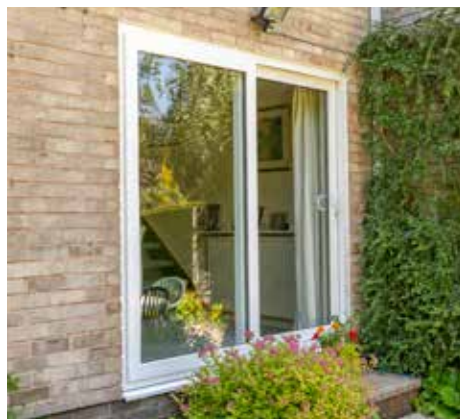
2 pane white inline sliding patio door with white handle