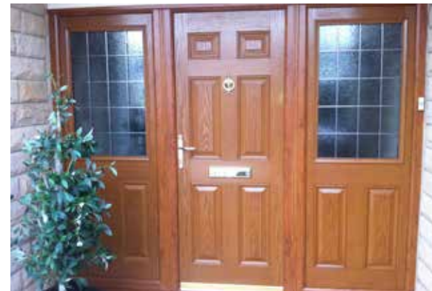
Golden oak 6 panel solid composite with composite side lights and square lead in top section