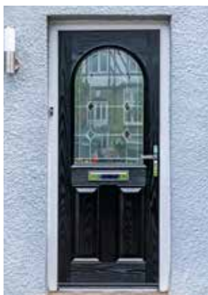
Black Elegance Arch style composite with Palma glass