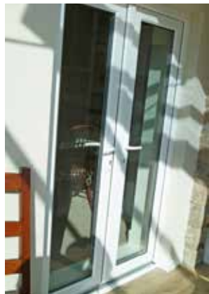
White French doors with white handles