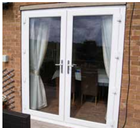
White French doors with silver handles