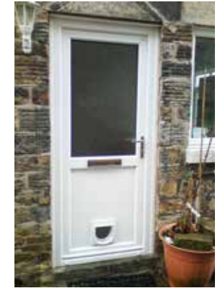
uPVC with midrail and plain panel to lower section with cat flap