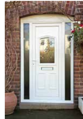
uPVC with Jacobean 1 Bevel A panel and fully glazed sidelights