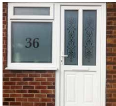
uPVC door and window with etched glass, midrail and vertical mullion