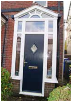
Blue Renown Diamond composite with Andaman brass and sidelights