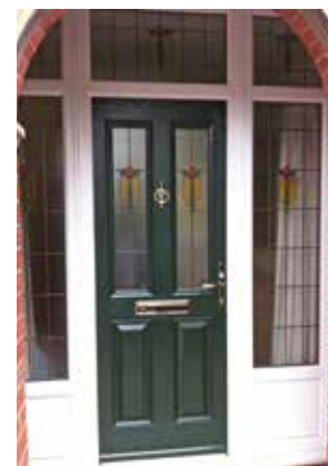
Green Esteem style composite in arched frame with bespoke coloured lead stained glass design