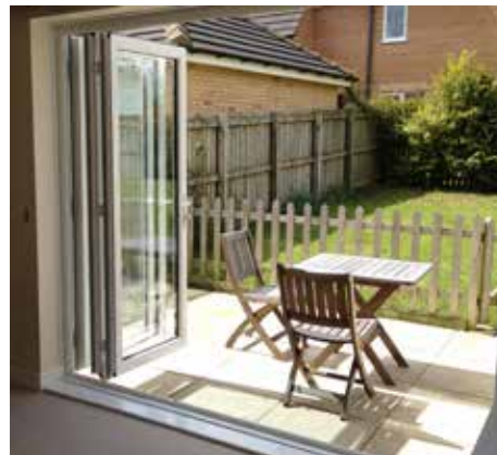
3 pane white bi-folding doors