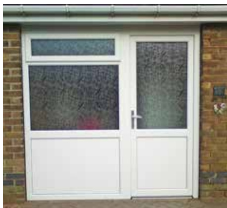
uPVC door and sidelight with midrail and plain panel to lower section