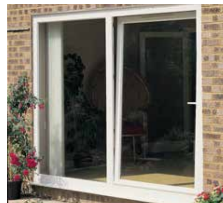
2 pane white tilt and slide patio with white external handle