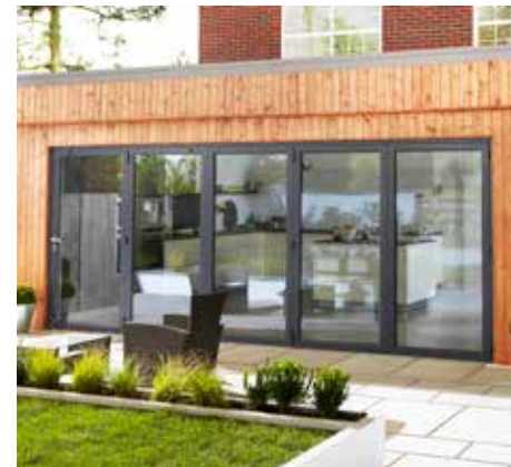
5 pane grey bi-folding doors