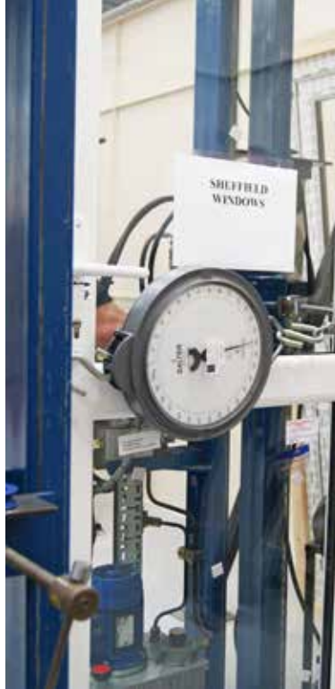
The weight of a Mini being applied to one of our uPVC doors