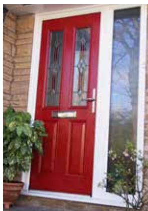
Red Esteem style composite with Roman bevel design and fully glazed sidelight