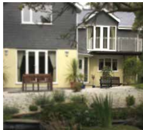
First floor, white French doors with sidelights