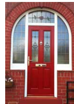
Red Esteem style composite in arched frame with lead and bespoke bevel glass design