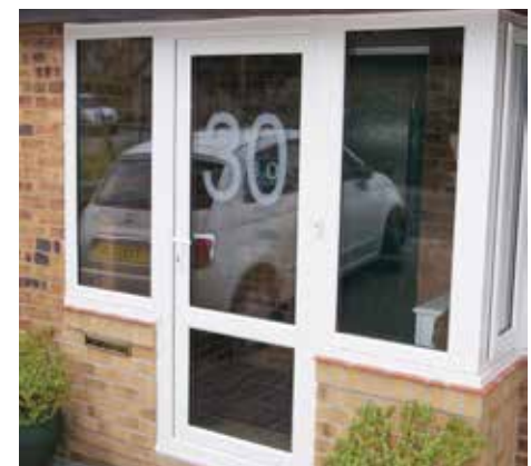
uPVC door with midrail, glazed top and bottom with an etched number in top section