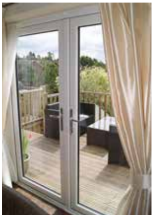
White French doors with chrome handles