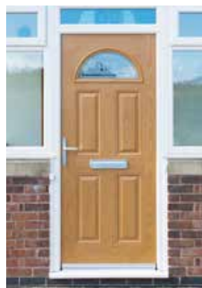
Oak Eclat Arch style composite with sidelights and number etched glass design