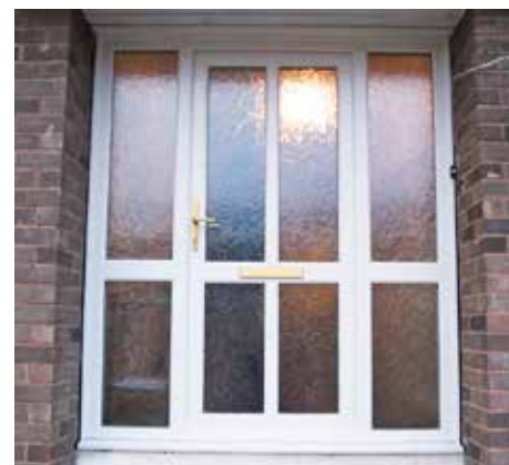
uPVC door with midrail and top to bottom vertical mullion with sidelights, also with midrails