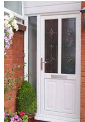
uPVC with midrail, vertical mullion and inverted Edwardian half panel