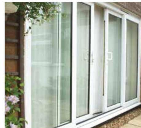
4 pane white inline sliding patio with two white handles