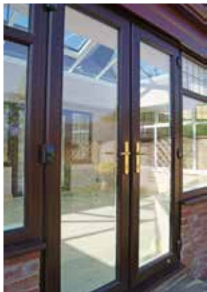
Rosewood French doors with gold handles in conservatory