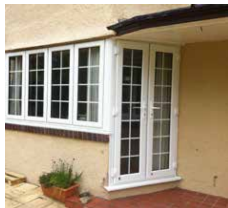
White French doors with white handles and Georgian fret