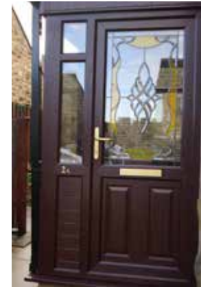
uPVC Rosewood with decorative glass, sidelight, midrail and transom