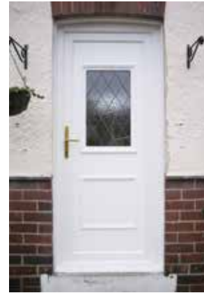
uPVC back door panel with diamond leaded glass