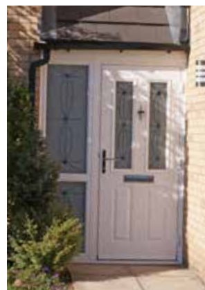
White Esteem style composite with sidelight and bespoke etched and bevelled glass design