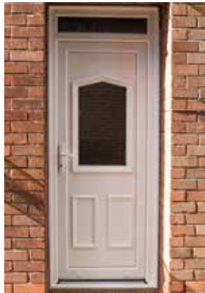
uPVC with Victorian panel