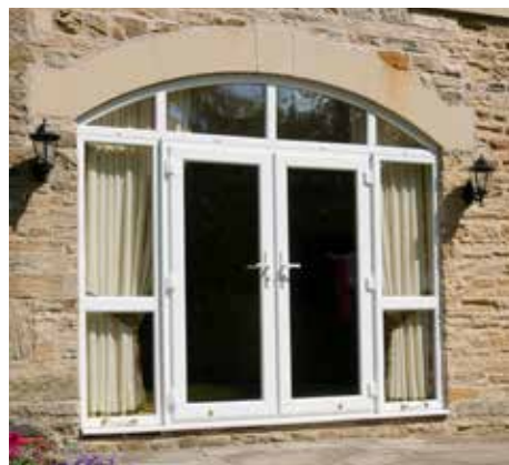
French doors with white handles, arched toplight and sidelights with midrails