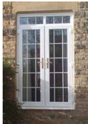
White French doors with white handles and Georgian fret