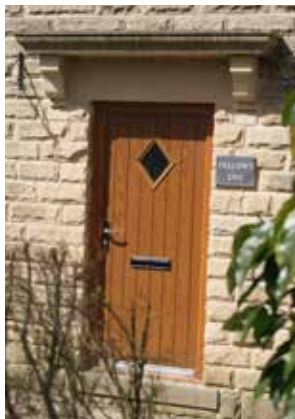
Golden oak Renown Diamond style composite with diamond glass