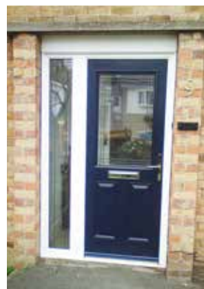
Blue Elegance style composite with sidelight and border lead