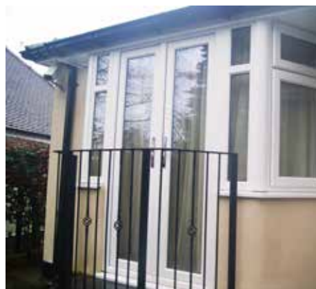
White French doors with chrome handles in centre of bay