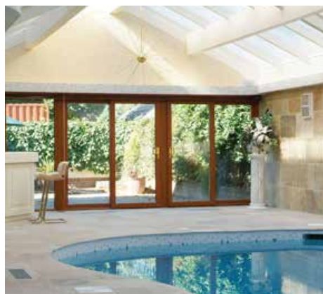
4 pane golden oak inline sliding patio with two gold handles