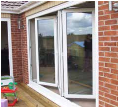
4 pane white bi-folding doors