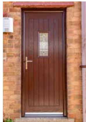
Rosewood Rustic Renown style composite with Kara glass design