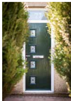
Green Esprit C09 style composite with etched glass