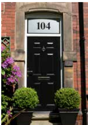
Black solid 6 panel composite with etched glass toplight