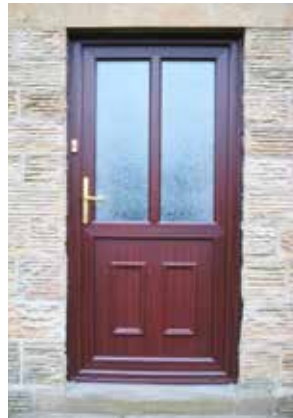
uPVC Mahogany with midrail, vertical mullion and Edwardian half panel