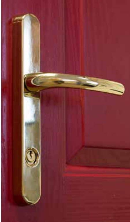
High security handle