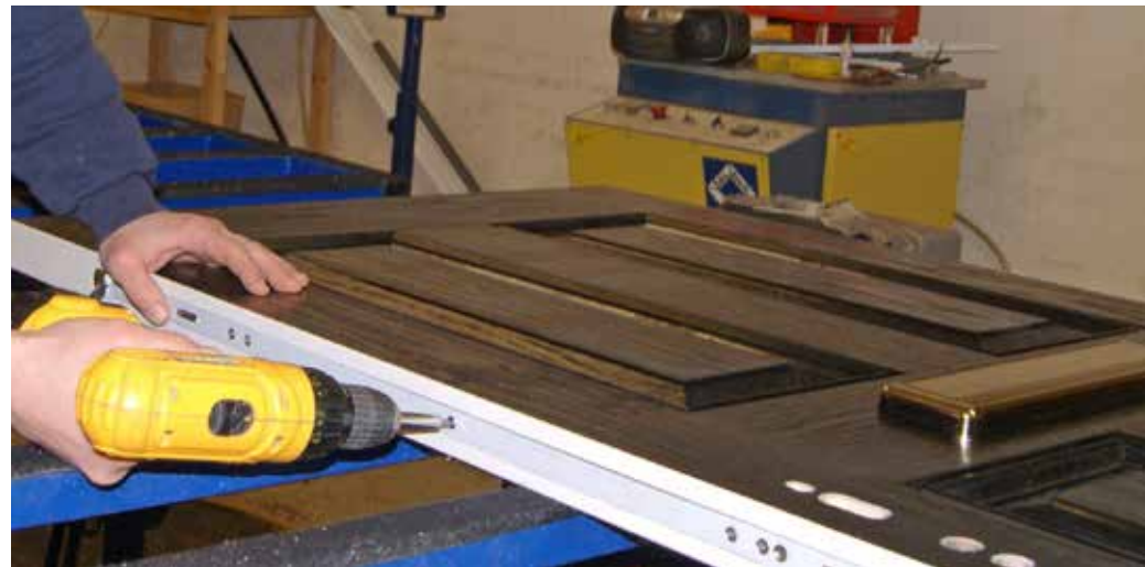
Door security features being installed in our factory

For maximum protection against intruders, every door installed by Sheffield Window Centre is fitted with a high security handle. These handles have patented features that make forced entry almost impossible, and when fitted in conjunction with our security cylinders, we can say with confidence that our doors give you total peace of mind.