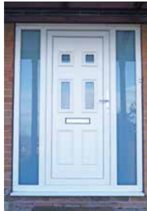
uPVC Edwardian 4 panel with fully glazed sidelights