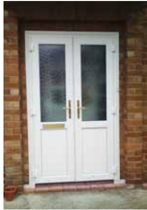
uPVC French doors with midrail and plain panels to lower section

All of our doors are made-to-measure and with so many designs, colours and finishes to choose from, the possibilities are endless! The following pages show a selection of doors we have manufactured in the past to give you some ideas and inspiration.