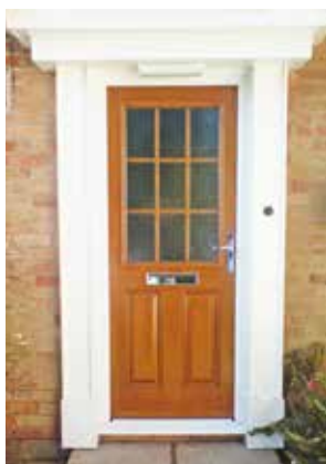
Golden Oak Elegance style composite with Georgian bar