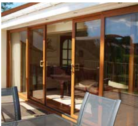
4 pane golden oak inline sliding patio with two gold handles