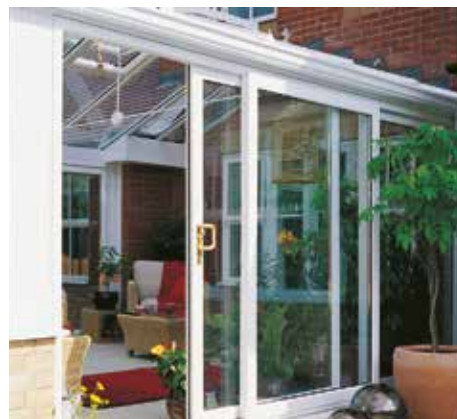
2 pane white inline sliding patio door with gold handle in conservatory