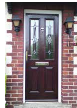
Rosewood Esteem style composite with Roman bevel glass design