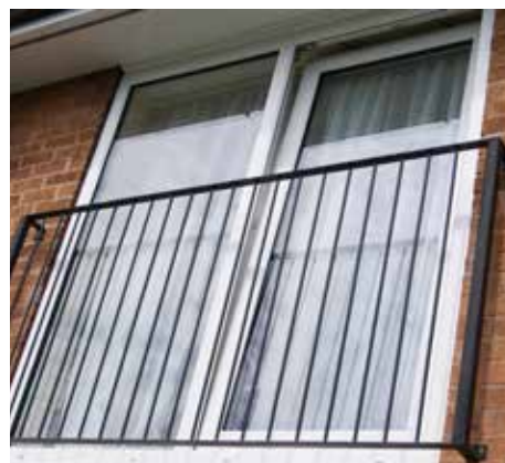
First floor, 2 pane white tilt and slide patio as part of Juliette balcony