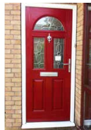
Red Eclat style composite with Andaman zinc glass