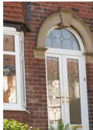
White French front doors with arched toplight and lead design