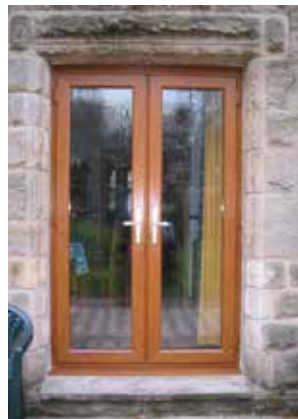
Golden Oak French doors with chrome handles