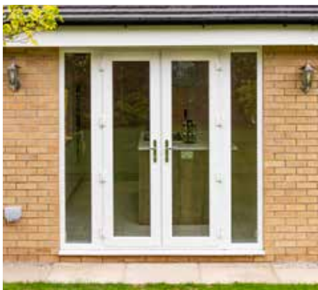
White French doors with chrome handles and full height sidelights